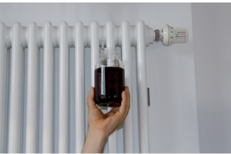
HEATING WATER WITH UMH

We would like to report on the experience with the UMH Heat devices, which we have implemented in our two large houses in the spring of 2011. We recently again took water samples from the heating system. As shown with previous inspections, the heating water is crystal clear and free of debris.