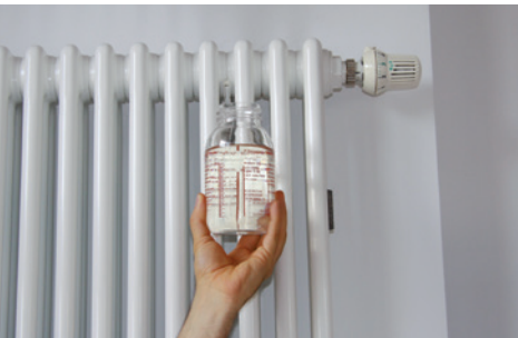
HEATING WATER WITH UMH

This clean water quality has fortunately also improved heat transfer in the heating system. The indoor climate has significantly improved since the installation of the heat equipment and people feel very comfortable in their living quarters.